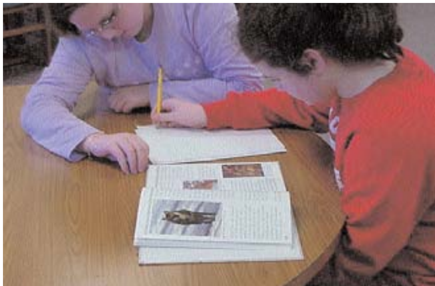
Include students in the construction, monitoring, and evaluation of their own portfolio work.

basic or access skill (e.g., learning to initiate requests and to follow two-step directions in the context of participating in a cooperative group in social studies).