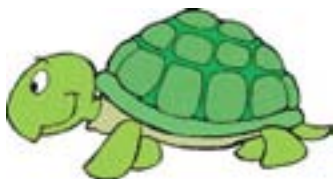
Figure 1: Class Assignment: Animal Adaptations Activity

Your task is to research a particular animal to learn about the various ways it adapts to its environment. The way an animal's body is designed makes it perfect for the environment in which it lives. You must include information about adaptations of